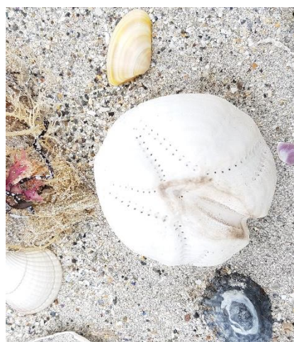
A sea potato or heart urchin