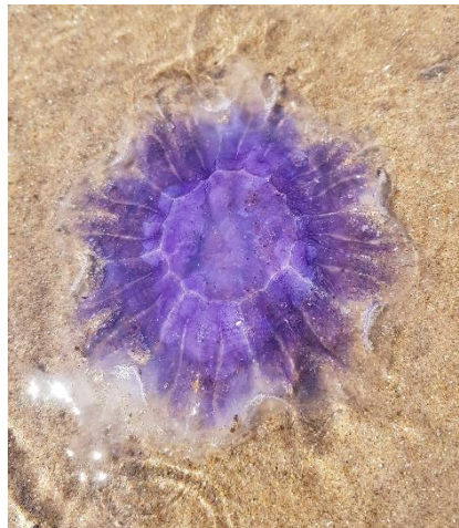
Jelly Fish (Blue Jellyfish – be careful some sting!)