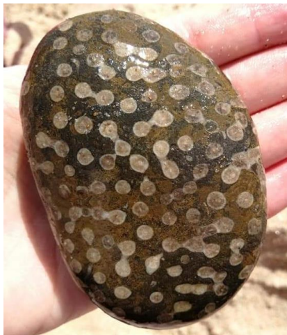
A fossil – this is a coral fossil (Berwickshire)