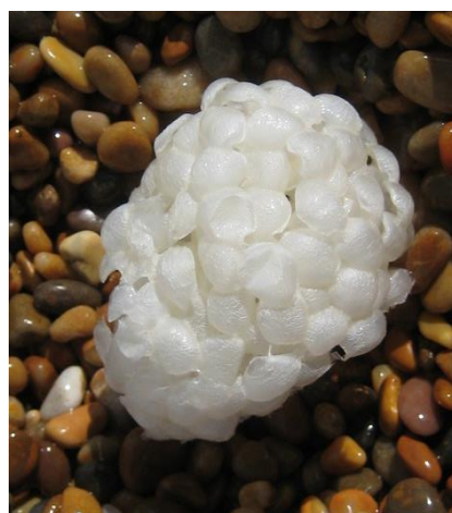
Whelk egg case