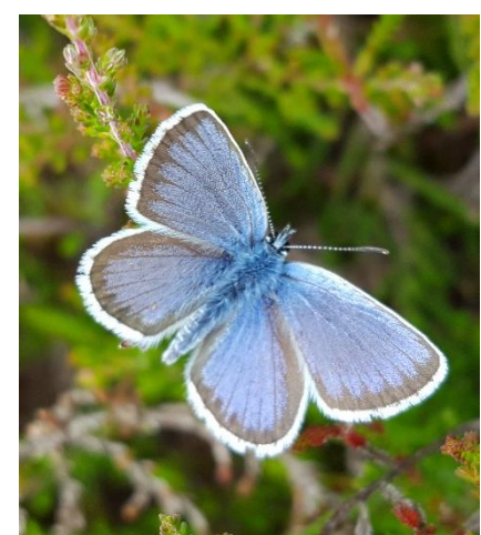
A Blue coloured butterfly (Common Blue)