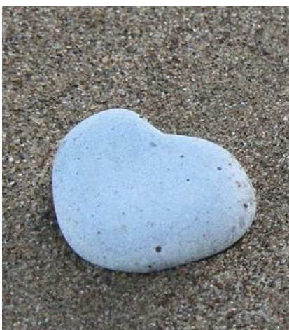
A Heart shaped pebble