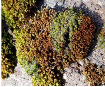
Interesting moss (a miniature forest!)