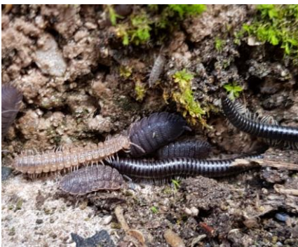
Mini-beasts close up