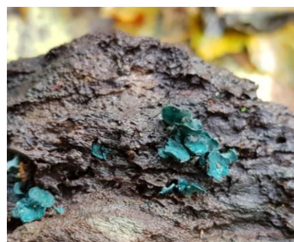
Something weird & wonderful (This is Blue Stain Fungi)