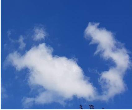
A cloud shaped like something... (This is my sneezing squirrel!)