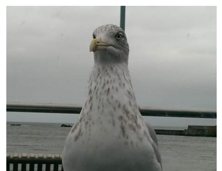
A close up of a bird (A gull watching me eat my car picnic)

Bonus Challenge - collect some photo evidence of your family getting up to these things: