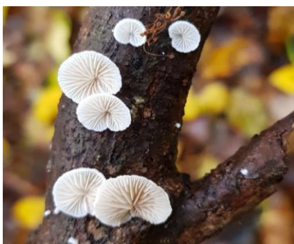
Interesting fungi or toadstools