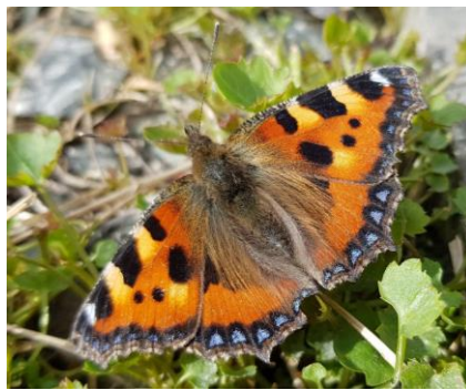
A butterfly relaxing