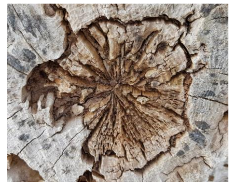
Patterns in wood